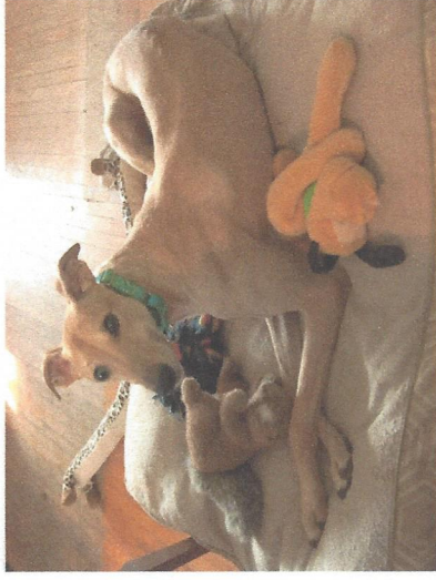
Homer is Forever Home

Lurchers have a great love of people. We find them to be affectionate, loyal, obedient and social as most have lived with other dogs.